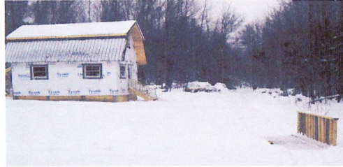
Our Daycare Facility

At Ruff "N" It Doggie Daycare, LLC your dog is treated as one of our pack. We understand your dog's needs and will provide space for him or her to have a safe and happy day while you do, too! We offer socialization & play in a group setting or private kennels with leashed walks in the woods. Small dog play area also available.